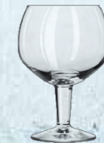
Gran Service 60 CL · 20 OZ ≈ h162 mm · Ø111 mm ≈ No. 921465