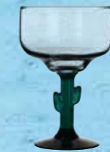
Cactus Margarita 35.5 CL - 12 OZ ≈ h156 mm · Ø102 mm ≈ No. 3619JS