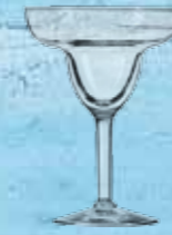
Citation Margarita 26.6 CL - 9 OZ ≈ h156 mm · Ø114 mm ≈ No. 8429