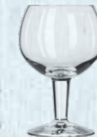
Gran Service 41.4 CL · 14 OZ ≈ h149 mm · Ø98 mm ≈ No. 921472