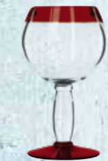
Round Cocktail 47.3 CL · 16 OZ ≈ h185 mm · Ø108 mm ≈ No. 92309R