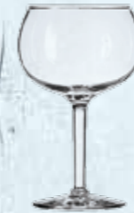
Bolla Grande 51.8 CL · 17.5 OZ ≈ h175 mm · Ø111 mm ≈ No. 8418