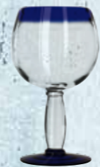
Round Cocktail 47.3 CL · 16 OZ ≈ h185 mm · Ø108 mm ≈ No. 92309