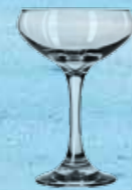
Perception Coupe 25.1 CL - 8.5 OZ ≈ h152 mm · Ø105 mm ≈ No. 3055