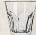
Gibraltar Twist DOF

35.5 CL - 12 OZ ≈ h92 mm · Ø92 mm ≈ No. 15963