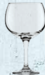
Copacabana 60 CL · 20 OZ ≈ h194 mm · Ø110 mm ≈ No. 3658VCL60