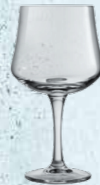
Arôme 60 CL · 20 OZ ≈ h203mm · Ø110mm ≈ No. 3713VCL60