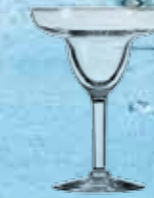
Citation Margarita 20.7 CL - 7 OZ ≈ h149 mm · Ø114 mm ≈ No. 8428