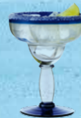
Aruba Margarita 35.5 CL - 12 OZ ≈ h162 mm · Ø118 mm ≈ No. 92308