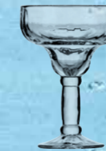
Yucatan Margarita 39.9 CL - 13.5 OZ ≈ h161 mm · Ø121 mm ≈ No. 5784