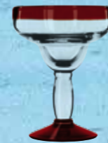
Aruba Margarita 35.5 CL - 12 OZ ≈ h162 mm · Ø118 mm ≈ No. 92308R